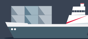
Efficiency of Khalifa Bin Salman Port

Dammam: 12 hours Riyadh: 24 hours Jeddah: 34 hours Processing time for general cargo: 10 hours Processing time for courier & express: 2 hours