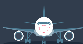
Transit time via Bahrain International Airport